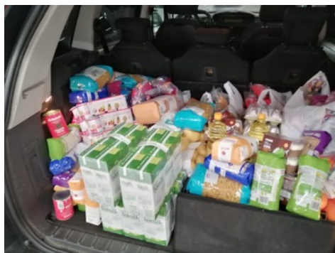
One day collection Food Bank

We have been in confinement as of today 49 days and still counting. They have allowed us to leave our home for an hour each day just to walk and then back home. We continue to have church online (see picture below). The Pastor has opened up our food bank once again because many of our people have lost their jobs and have no resources. After the middle of May we could open our church but only a maximum of 20 people could attend with a 2 meter distance between them. If we go to 3 or 4 services, we have to disinfect the entire church and wait for 3-4 hours to have another meeting so for now, that is not possible. Thanks to those who have decided to send additional help during this difficult time. God bless each one.