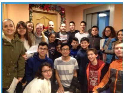
SINGING GROUP OUT IN OUR HALLWAY

I N We shared a special time during the holidays with the part of our family that is close by and with others by phone, email and Skype who are scattered all around the world serving the Lord. All those cards and letters from you, our friends and supporters, were appreciated as well. We are already looking forward to Spring to be able to get back out to camp to do maintenance and finish up several projects. Today the province of Guadalajara had the lowest temperature in the entire country: 12° F. Not very tropical!